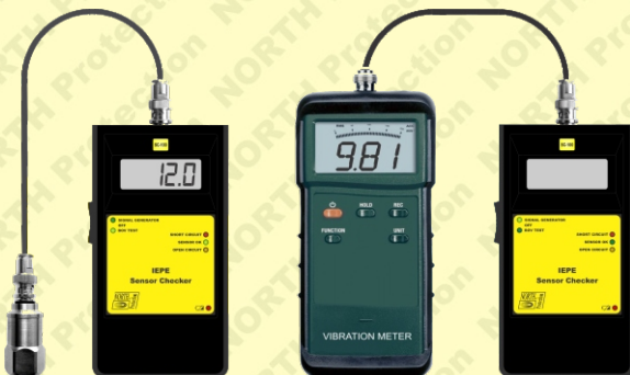
BOV Test Mode